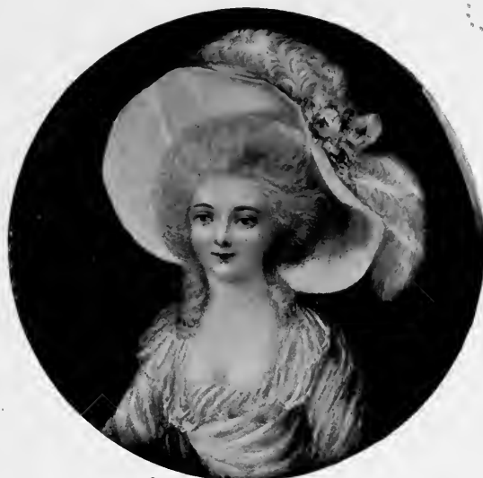
MADAME DUPIN (Ob. 1799) BY JEAN MARC NATTIER